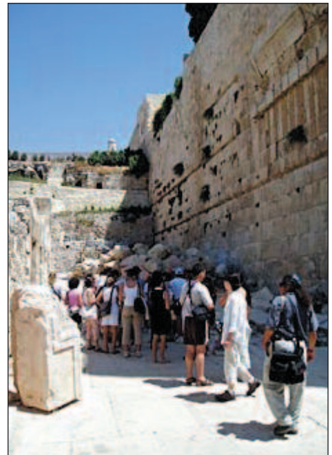
Those visiting Israel never miss The Wailing Wall.

Mission participants are sure to come away with a newfound understanding of where we've been as well as a vision of