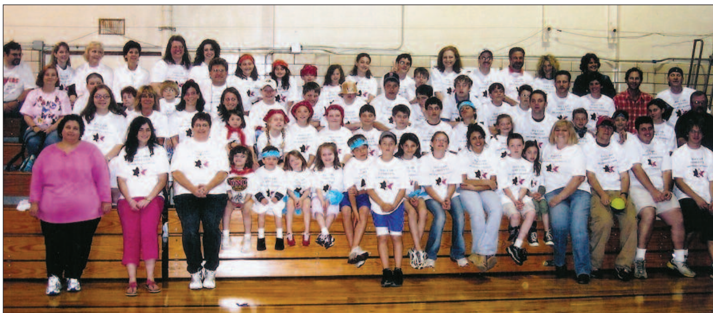
Sunday School students gathered for a group picture following the Maccabean Games. For the second straight year the Games marked the end of Sunday School, and each student received a T-shirt and a trophy, courtesy of UNO's Chicago Grill.