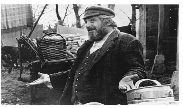
Tevya and Fiddler on the Roof will be shown Feb. 28 as part of the annual Film Festival series.